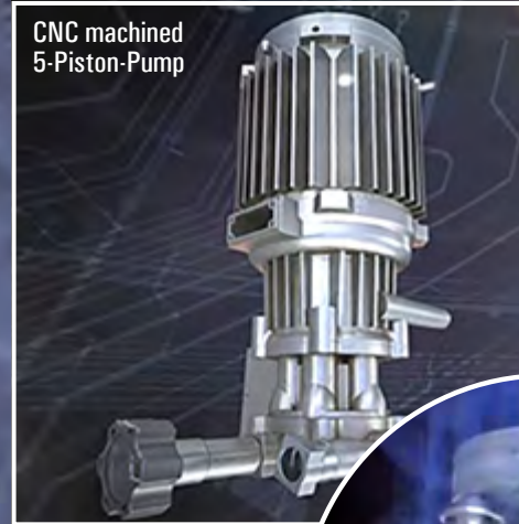
CNC machined 5-Piston-Pump