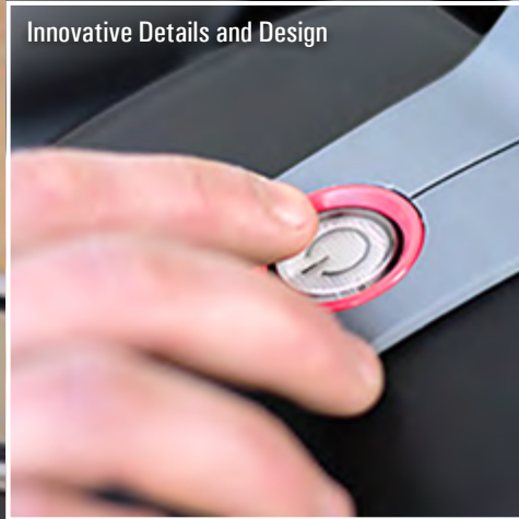
Innovative Details and Design